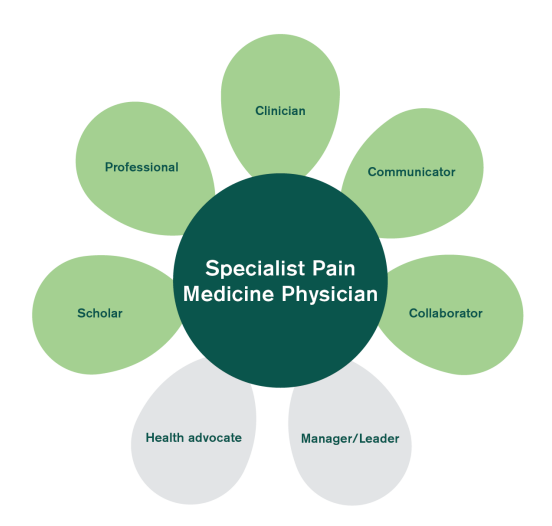
Diagram 4.2.1 Roles in practice in focus during the CTS

At the completion of all requirements for the CTS, as outlined in section 12.1, a trainee must undertake a core training stage review with the supervisor of training. Upon successful completion and submission to the faculty of this review, the trainee will be eligible to progress to the practice development stage.