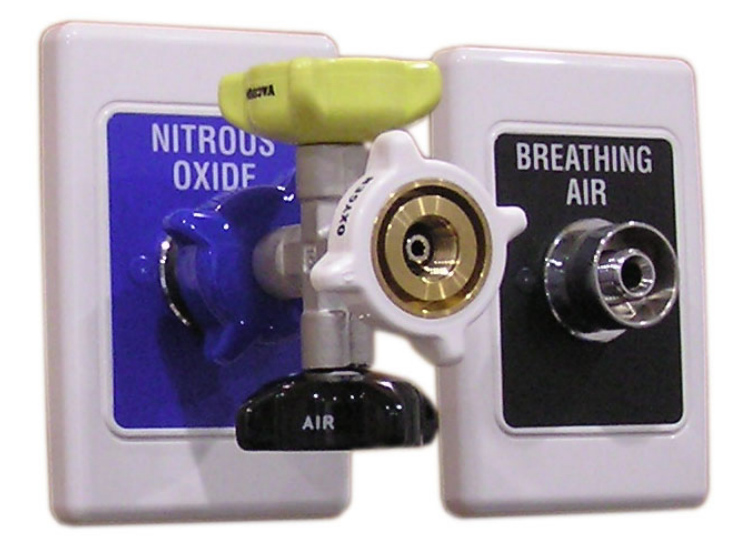
Figure 2. Example of tool for testing gas-specific connection at the terminal unit

All instruments must have been calibrated within the previous 12 months, or lesser period if recommended by the instrument manufacturer.