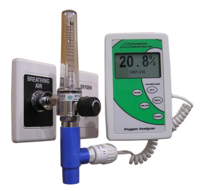
Figure 1. Example of gas analyser for testing gas identity at the terminal unit