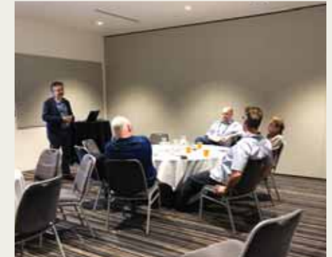
Above: Delegates in workshops.